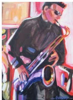
The Blind Saxophonist